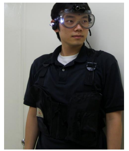
Fig. 2. Photograph of a model paramedic wearing the EVAT system.

without the user's control operation. Attached strongly on the center of an eye protection goggle (s-506V, OTOS, Korea), it provides almost same visual field of the wearer. The goggle was designed to be wearable over the eye glasses. The WIBRO modem, KWD-U1300, has an internal antenna, weighs 20g, and follows IEEE802.16e standard. The WIBRO modem provides the 2.5Mbs upload and 10Mbps download speed at maximum. The PC cam and the WIBRO modem are connected to the UMPC (B1SE, Wibrain, Korea) through an USB interface. The Wibrain B1SE features a light weight of 500g including battery, and a small size of 19cm in length. The total weight of the EVAT unit is less than 1kg so that it can be carried in a pocket of safety vest. Figure 2 shows a picture of a paramedic carrying the EVAT unit.