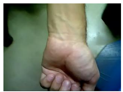
Fig. 4. A captured photograph from the transmitted real time video images using the EVAT system.

The maximum frame rate varied 3-5fps depending on the situations. Although it is not smooth for human eye which regards 15 fps at least as a smooth movie, it was confirmed enough for transmission of medical information by emergency doctors. Fig. 4 shows a captured image of the transmitted video on the monitor of emergency room computer, showing hand and wrist of a model patient. Vein patterns and details of the skin are observable.