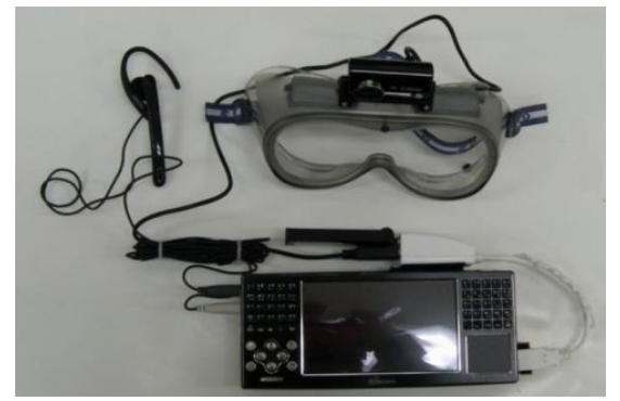
Fig. 1. Developed EVAT system consisting of a PC cam on a protection goggle, a UMPC, and a mic-earphone set

Wireless Broad Band Internet (WIBRO), one form of the Mobile WIMAX, is a newly commercialized wireless internet service in Korea. It is available in Seoul Metropolitan region now, but service area is expanding gradually over the whole Korean. WIBRO provides 1M bps data transmission rate in average, and sustains its transmission rate in a vehicle moving as fast as 90km/h. Its fast data transmission rate and robustness to mobile applications make it suitable for pre-hospital treatment application. Not only inside of the building where internet access points are not available, but also in a running ambulance car, the paramedic personnel can communicate with emergency doctors in the hospital while sharing continuous image of the patient. With provided information the physician can give correct guidance which is vital in emergency cases.